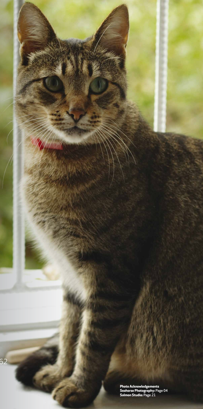
Photo Acknowledgements Seahorse Photography: Page 04 Salmon Studio: Page 21