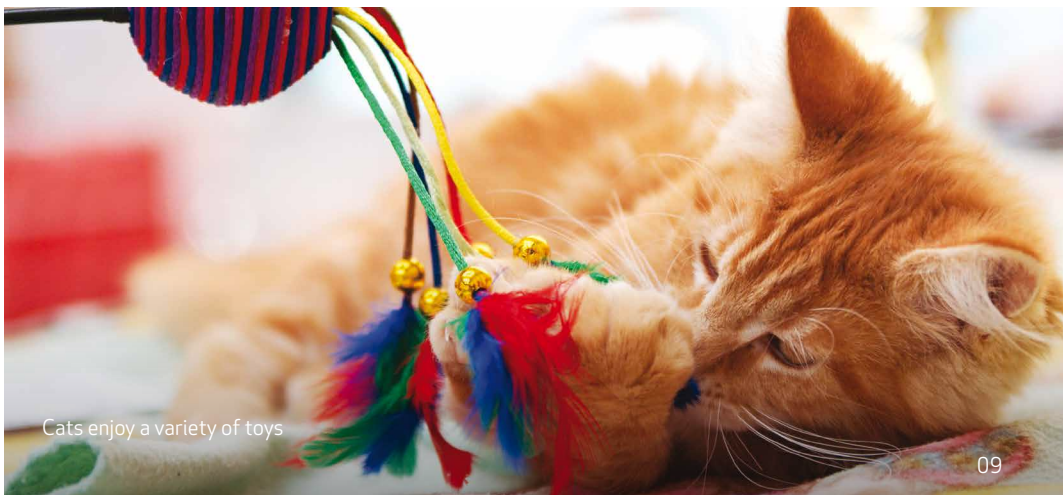
Cats enjoy a variety of toys