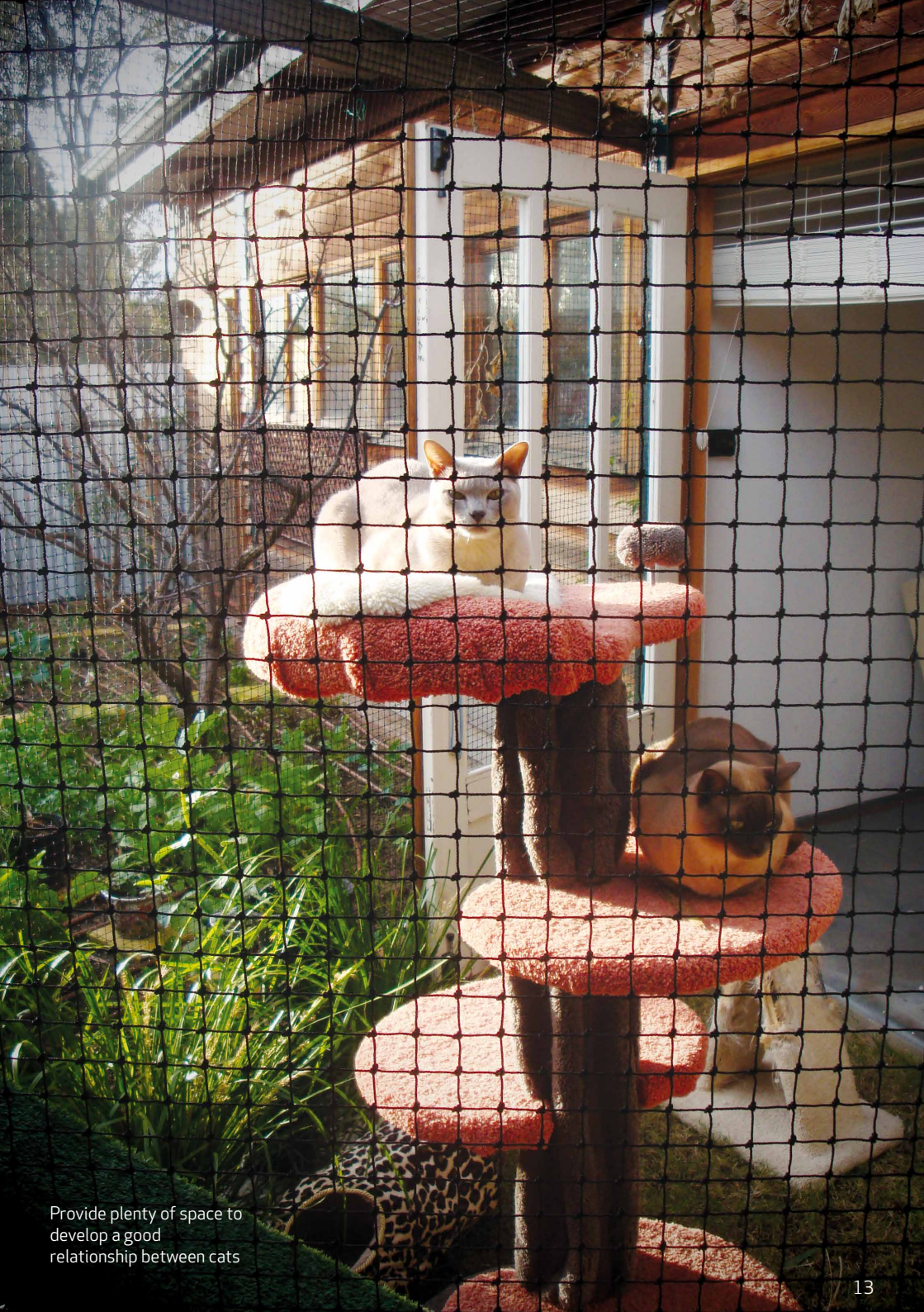
Provide plenty of space to develop a good relationship between cats