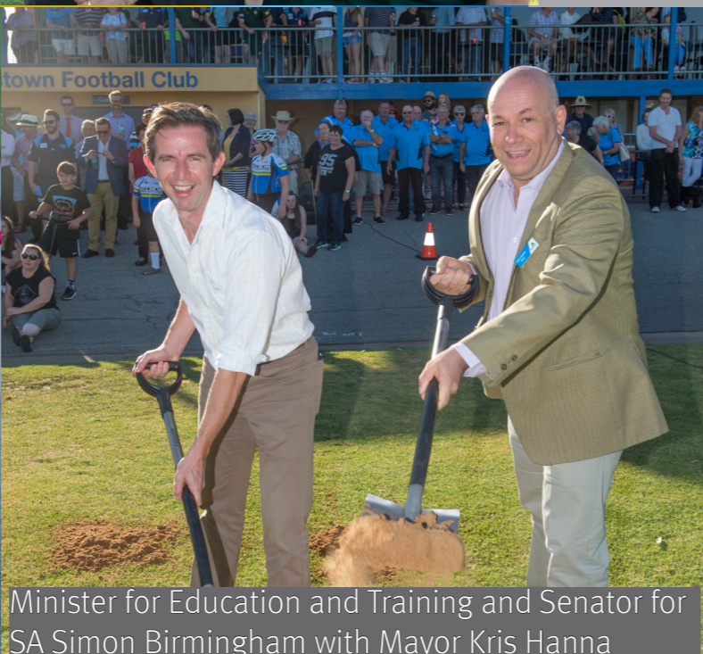
Minister for Education and Training and Senator for SA Simon Birmingham with Mayor Kris Hanna