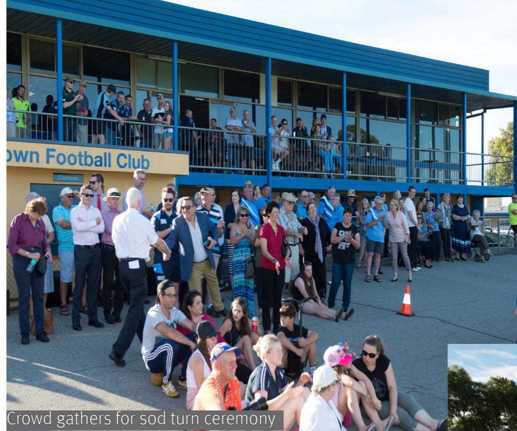
Crowd gathers for sod turn ceremony